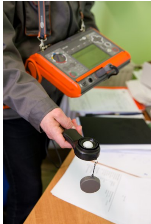
Photo. Illuminance measurement.

- measurement in luxes (lx) or feet-candles (fc)